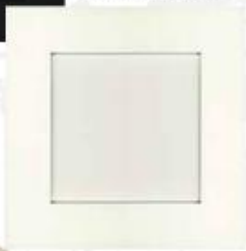
crescent white shaker cabinets