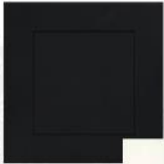
black satin shaker island