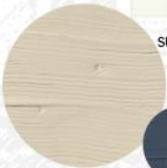
summer wheat exterior